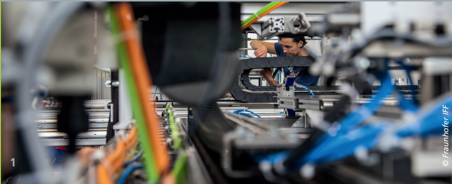
1 EMELI expedites machine development