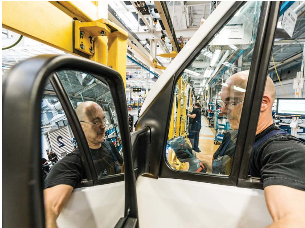
Installing side view mirrors on light commercial vehicles is not always easy because of the wide variety of models. Outwardly, the mirrors are virtually indistinguishable.