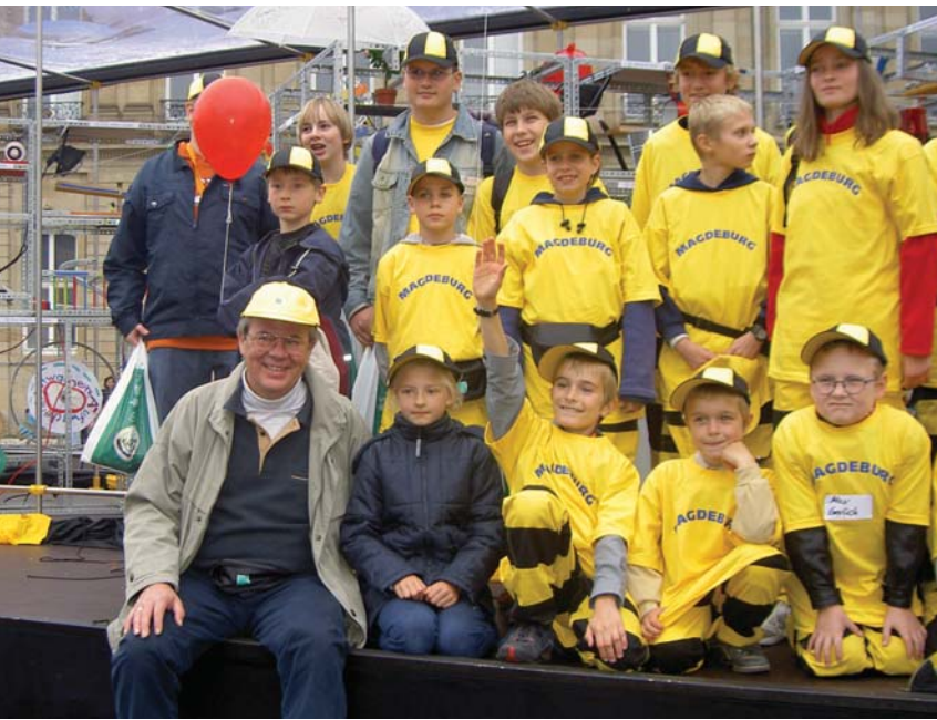
Recognized with the VDI Badge of Honor in 2015.