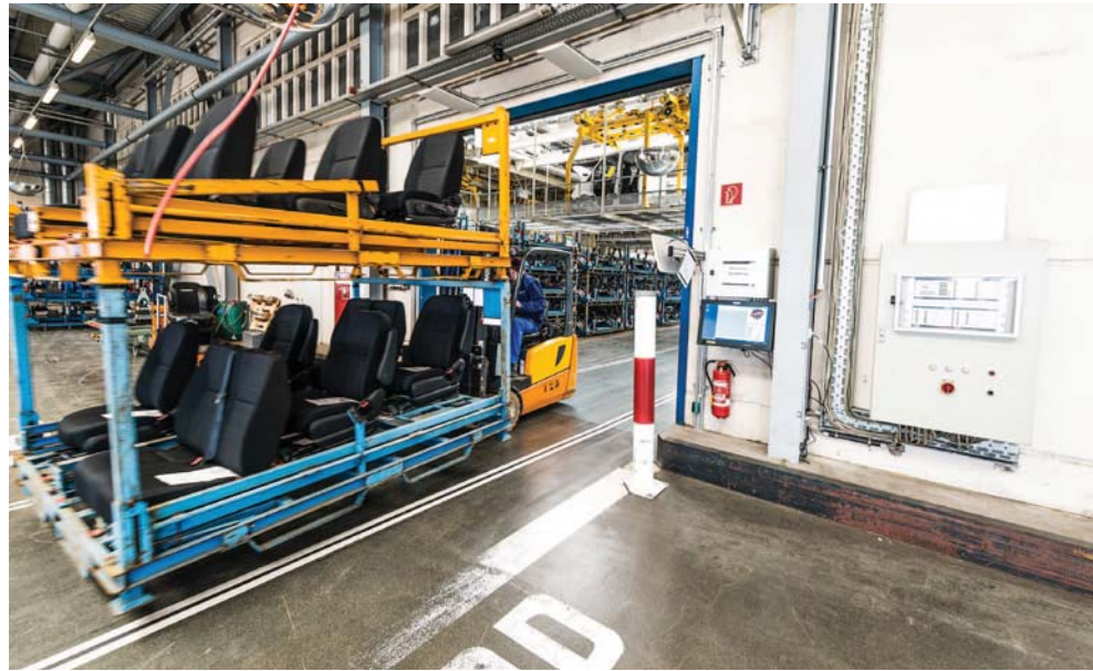
RFID readers on the gate automatically scan the pallet with seats all at once without contact.

Since RFID transponders had not been used in this domain before, the ideal transponders for the conditions in Ludwigsfelde had to be identified first. The researchers did this using the test laboratory at the Saxony-Anhalt Galileo Test Bed in Magdeburg's Port of Science where numerous transponders compliant with VDA standards have been tested and