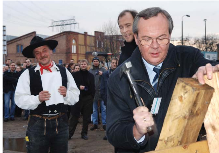
Hammering in the symbolic final nail at the topping out ceremony of the Virtual Development and Training Centre in Magdeburg’ Port of Science.