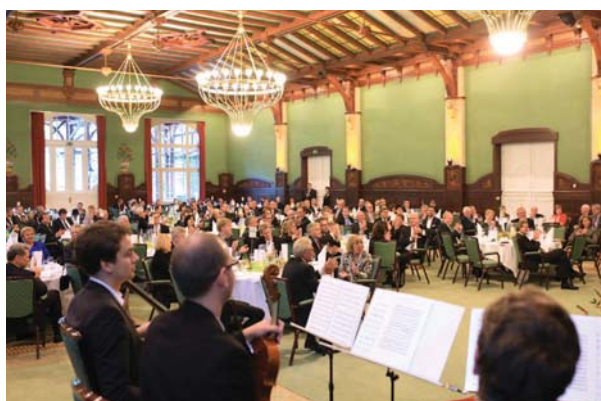
Anniversary ceremony with 250 guests from government, business and research.