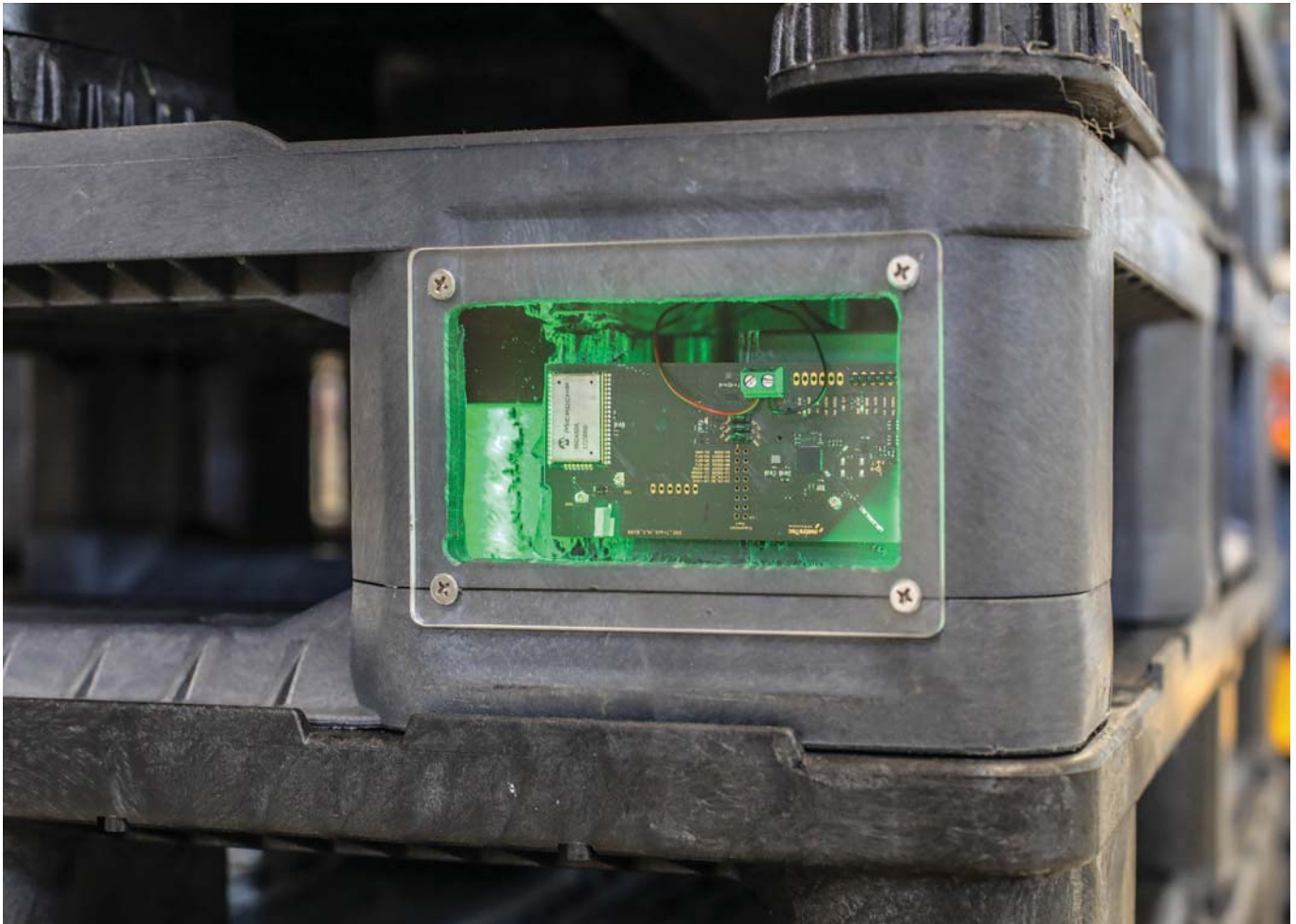
As is easy to see on this prototype, printed circuit boards are integrated in hollows in pallets and covered. This has two advantages. Printed circuit boards are well protected against impacts and mechanical stresses and they can be easily removed and reused whenever a pallet has completed its service after approximately fifty runs.

covered hollows. That has two advantages. On the one hand, printed circuit boards are well protected from impacts and mechanical stresses. A plastic pallet expanding in the sun might cause mechanical stress that could damage a printed circuit board cast with the plastic. On the other hand, a printed circuit board can easily be removed from a hollow and reused once a pallet has completed its service after around fifty runs.