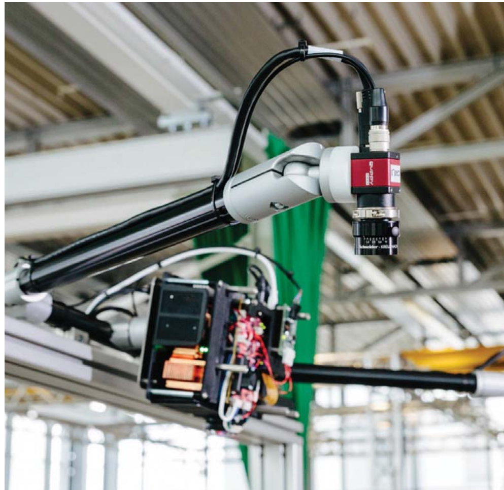
Combined sensor unit above a workspace: One projector and two cameras are combined and synchronized in one module.