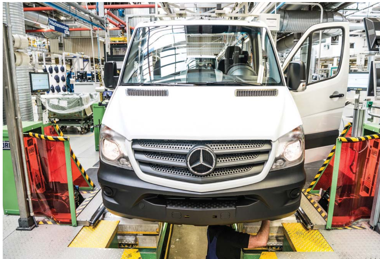
While employees are inspecting vehicles, readers above the test bench are automatically inspecting whether every part with an RFID tag has been installed in the right vehicle

Side view mirrors actually tend to be standard products with little variation. One might think