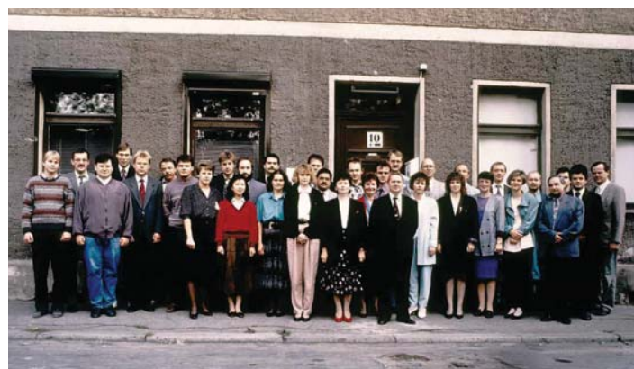
The starting team of the Fraunhofer IFF in 1992 in front of its first building, which the institute temporarily occupied at that time.