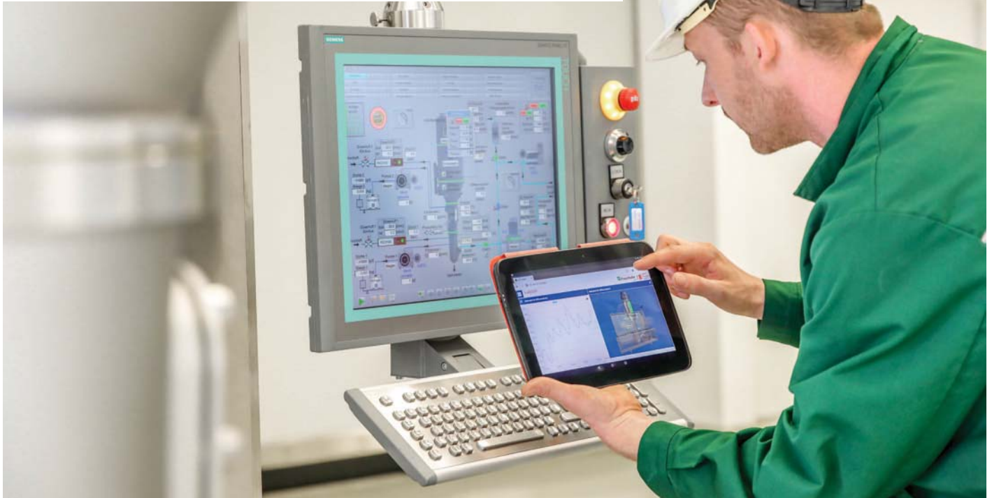
Digital assistance on a tablet. The affected component of a malfunctioning plant is projected on an image of the real plant on a tablet by means of AR assistance. Technicians can view temperature and pressure curves, for instance, overlay parts virtually or display instructions. They have all relevant information at hand with one click.

» RATHER THAN DOING THE THINKING FOR MAINTENANCE TECHNICIANS, WE WANT TO ASSIST THEM EXPEDIENTLY AND INTERACTIVELY. «