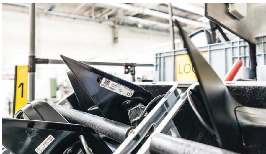
Virtually indistinguishable at first glance: Side view mirrors in a box before final assembly. The reader above the box reads the RFID chips on the mirrors. Every one is identified automatically. Mix-ups are impossible.

evaluated under realistic conditions. "The most important criteria were reliability, good read performance and, naturally, price per transponder," says Martin Kirch, the researcher at the Fraunhofer IFF who performed the tests. The RFID transponders selected are ideal for use from suppliers to final assembly.