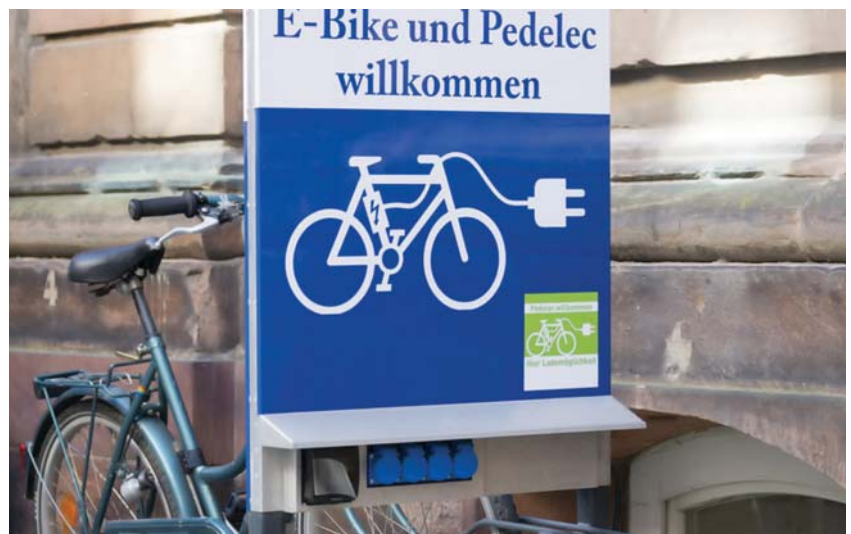
Public charging stations for e-bikes can help close connection gaps in mass transit.

These partial services have been implemented in pilot applications. The researchers are optimistic that they will soon also simplify real operation of mass transit services in Saxony-Anhalt.